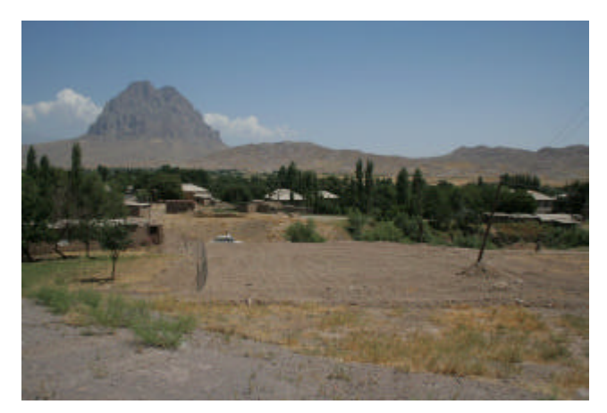
Site of the Armenian church in Abrakunis. Aug. 2005.

In the middle of December 2005, two hundred members of the Azerbaijani Armed Forces proceeded to break up and destroy the tombstones of the historical Armenian cemetery in Djulfa, which represented the most significant collection of Armenian large Khachkars. The Azeri action of 2005 destroyed every monument that had so far endured and was the culmination of the destruction of St John's Church in Abrakunis (Sourb Karapet - built in 1381), as well as the numerous churches of Agoulis, Chanegha, Ilandagh (Odzasar), Hatsi Sar and Shorot.